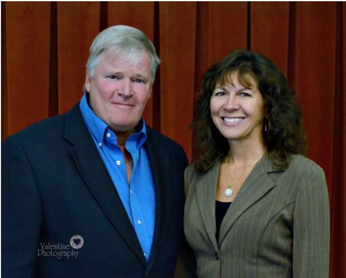
Louisville Rotary Home Page