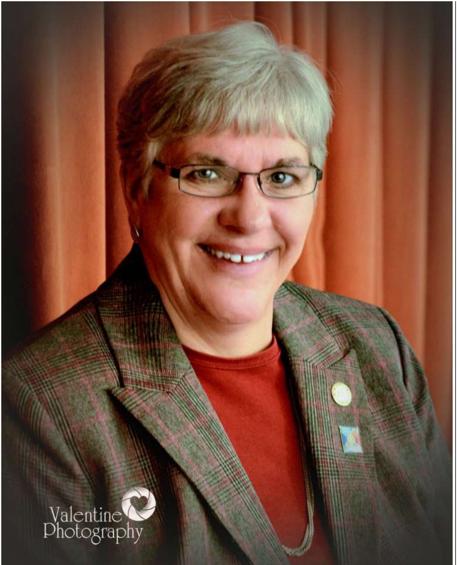
Louisville Rotary District 6650 Meeting Notes